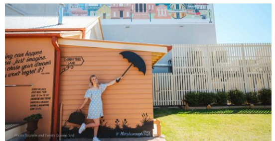
Historic Maryborough – A spoon full of sugar...