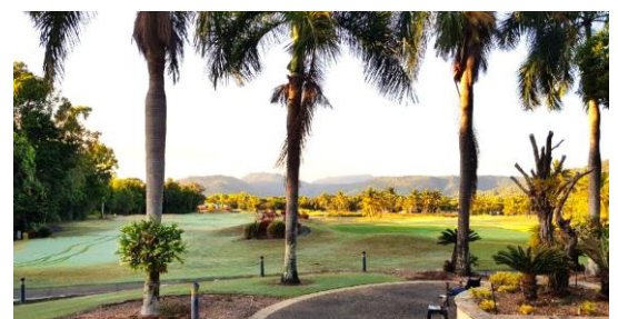
Queensland's sunny winter mornings

Your tour will officially end after breakfast on Mon 2 Sep at the Oaks Resort and Spa, Hervey Bay. You may want to stay on for a day or two to explore the area – in particular Fraser Island / K'Gari. Hervey Bay airport is 10 minutes drive away with daily flights to Brisbane and Sydney with connections beyond. Jetstar now also have direct flights to Melbourne. Reception can help with taxis if required. AllTrails are also driving to Brisbane on Mon 2 Sep and are offering transfers for cyclists.