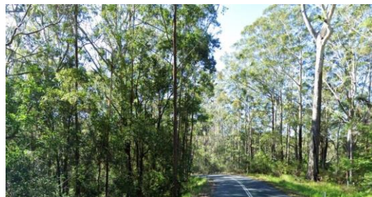
A typical view from the handlebars in the hinterland

Day 3. Today presents a totally different vibe to yesterday's ride. We are well and truly out of the urban sprawl here, with lovely rich land that produces strawberries, bananas, pineapples and pawpaw - you may even want to stop by a roadside stall and select some produce fresh from the farm for a snack. Kilcoy is our morning tea stop this morning, after which we head back to Woodford via a stunningly scenic ride through the open, green farmlands that eventually give way to bushland, as the quiet road becomes enveloped by trees on either side as it follows the flow of Delaneys Creek back to the highway and back to our accommodation at Woodford.