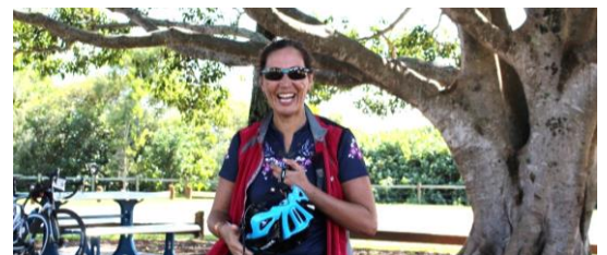
Happy cyclists – every day!