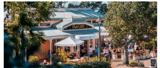
Montville rest stop – Day 5