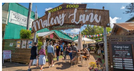
Spend two nights in delightful Maleny

Day 5. Staying in picturesque Maleny again tonight, we will transfer cyclists to Kennilworth this morning to take on the locals' favourite; the Maleny loop ride. On the road, our cycling group will enjoy lovely backroads, that make their way through a region littered with National Parks, State Forests, Environment Reserves, springs, creeks, falls, parks and lookouts. There are a couple of challenging climbs that cyclists can take on, or skip over in our vehicle, but either way, you'll be back in Maleny for lunch and a relaxing afternoon before our longest day of the tour tomorrow. Want to take the day off? Have a sleep in and check out a few of the local attractions - there's plenty to see and do around Maleny.