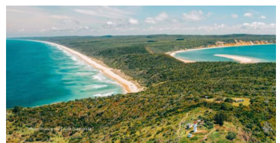
Queensland's beautiful landscapes