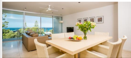
Rainbow Beach accommodation – Day 7 & Day 8