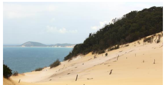
Carlo Sand Blow - Rainbow Beach

Day 11. After breakfast the tour officially disbands but make the most of the Fraser Coast. You are just a ferry ride away from K'gari / Fraser Island – the world's largest sand island and a stunning and fascinating day trip from Hervey Bay. Head down to the Visitor Centre to check out tour options or find your perfect trip online. Thanks for joining us on this wonderful, warm weather winter getaway in Southeast Queensland.