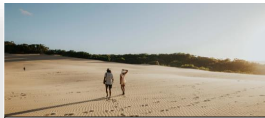
Rainbow Beach rest day – Day 8