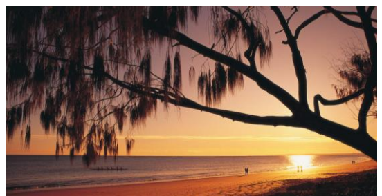
Hervey Bay sunset – what a finish line